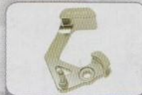
SHORT SHIFT KITS