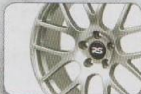
LIGHT WEIGHT WHEELS