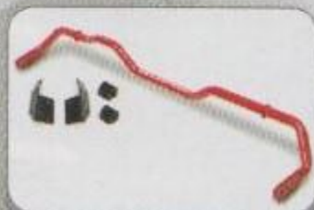
SWAY BAR KITS