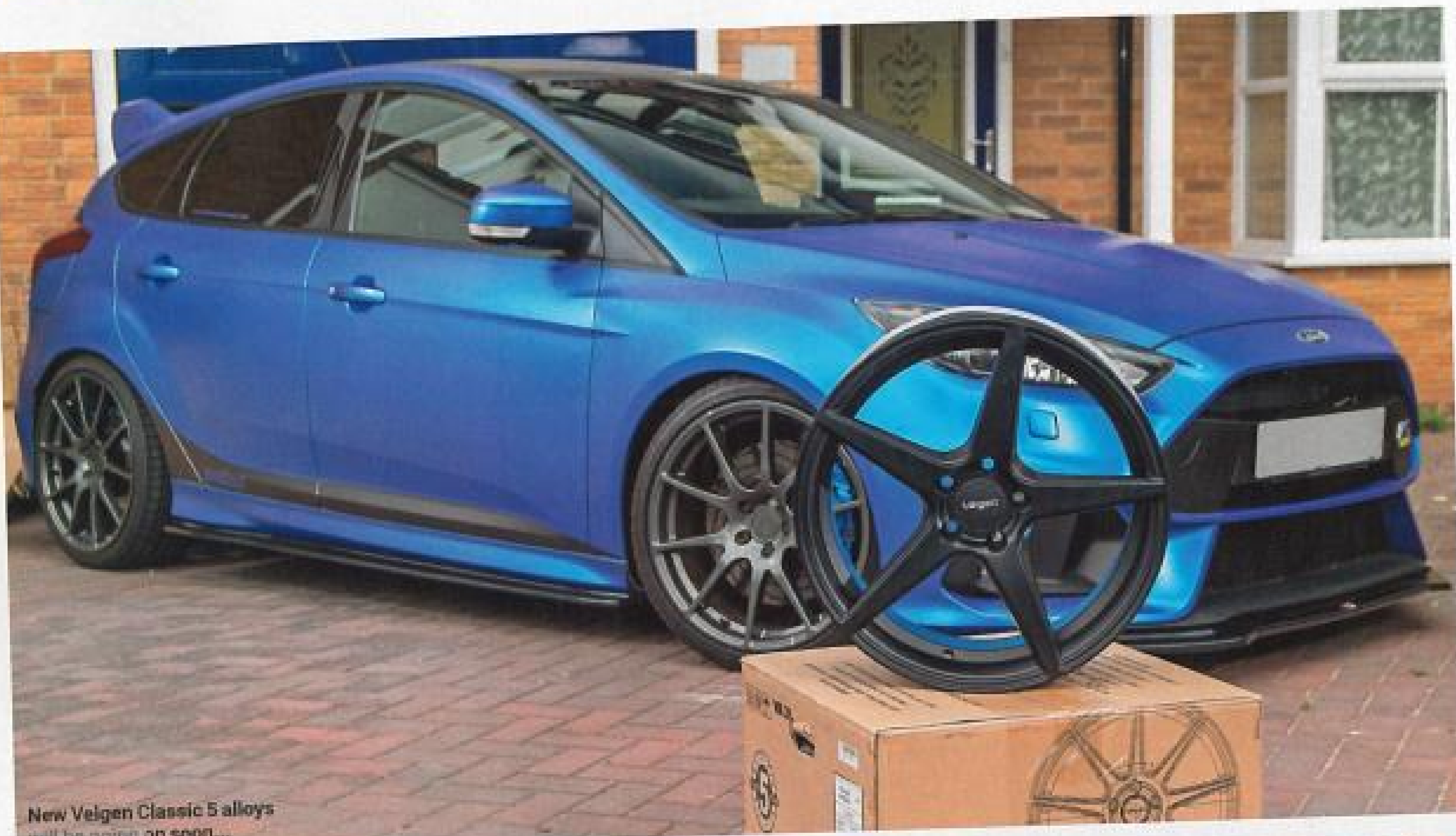
New Velgen Classic 5 alloys will be going on soon...