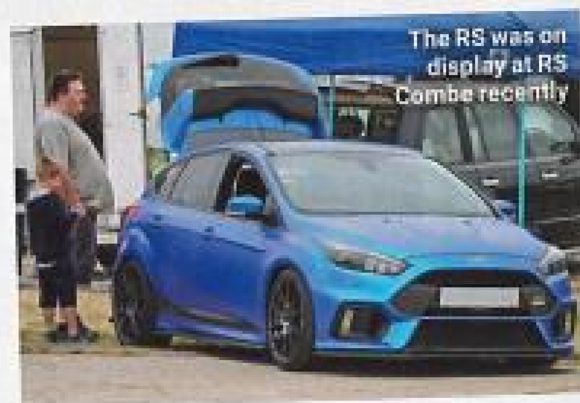
The RS was on display at RS Combe recently

Velgen is a brand associated with high-value sports and supercars, specialising in the Ford market for the mighty Mustang,