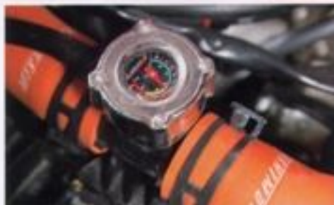
Under pressure... with a Mishimoto radiator cap.

WWW msperformance.com , artisanperformance.com , chargespeed.com , hksusa.com , mishimoto.com , mishimoto.com , pride-performance.com , rceng.com , sparcousa.com , stance-usa.com , toyota.com